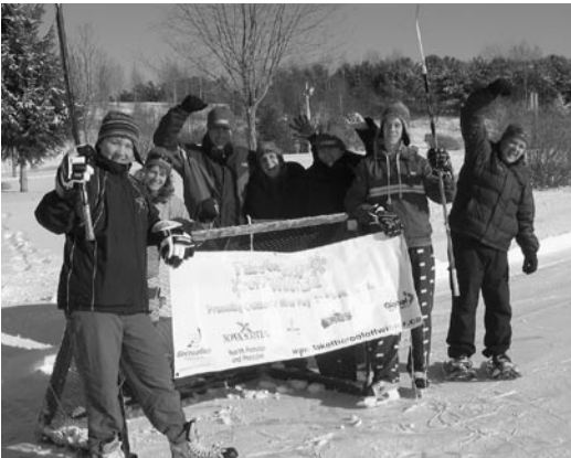
“Take the Roof Off Winter” supporters enjoying winter fun.

This year the Recreation Matters committee was very busy planning and delivering the June is Recreation Month and Take