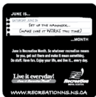
Sample Print Ad

RNS produced two radio PSA's, two newspaper inserts and one feature article that are designed to increase awareness and understanding of the role recreation plays in the health and wellness of our communities and quality of life of our citizens. These, as well as logos, are available on our Web site.