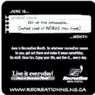
Sample Print Ad

R NS produced two radio PSA's, two newspaper inserts and one feature article that are designed to increase awareness and understanding of the role recreation plays in the health and wellness of our communities and quality of life of our citizens. These, as well as logos, are available on our Web site.